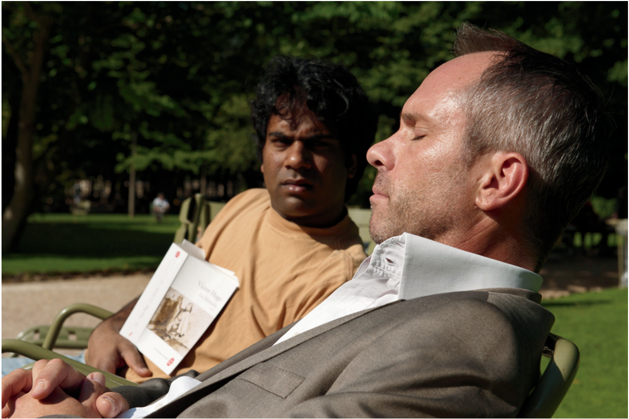
Sunil Gupta, Untitled #10 , from Sun City , 2010 , color inkjet print, 39 \frac{3}{4} x 29 \frac{1}{2} in. (100 x 75 cm)