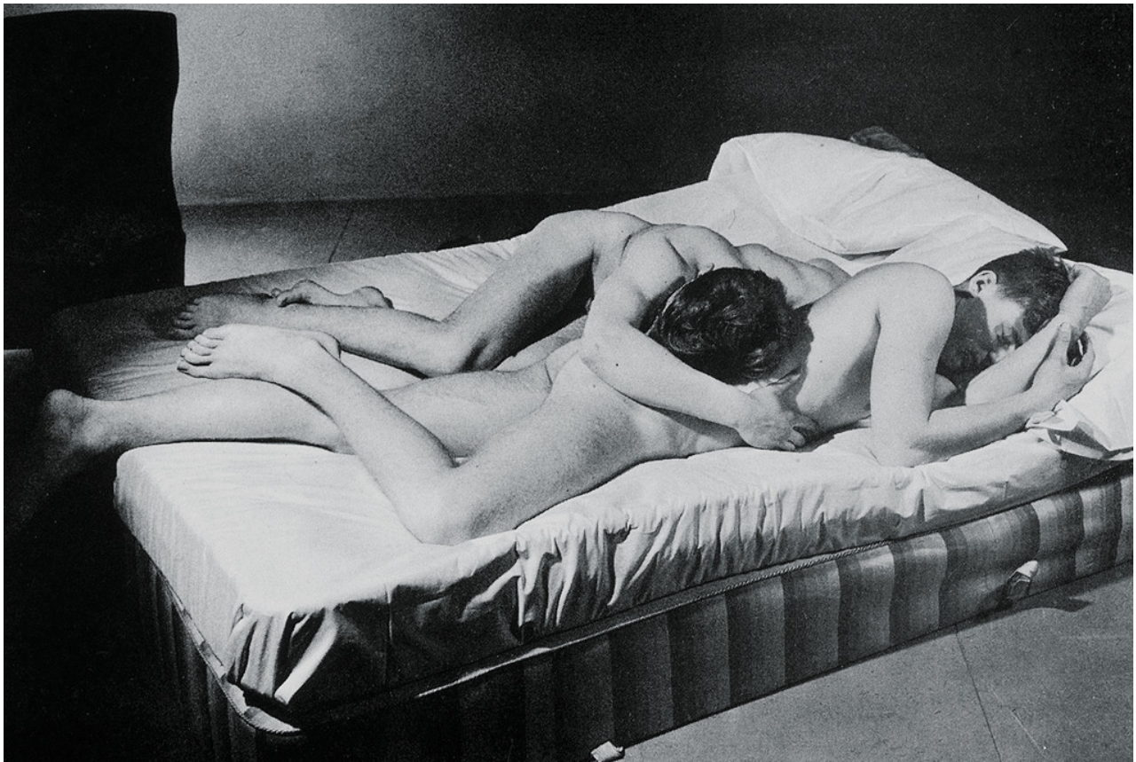
George Platt Lynes, Male Nudes, n.d.