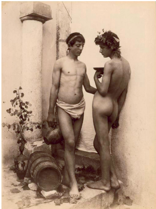
Wilhelm von Gloeden, Bacchanal , ca. 1890s (artwork in the public domain)