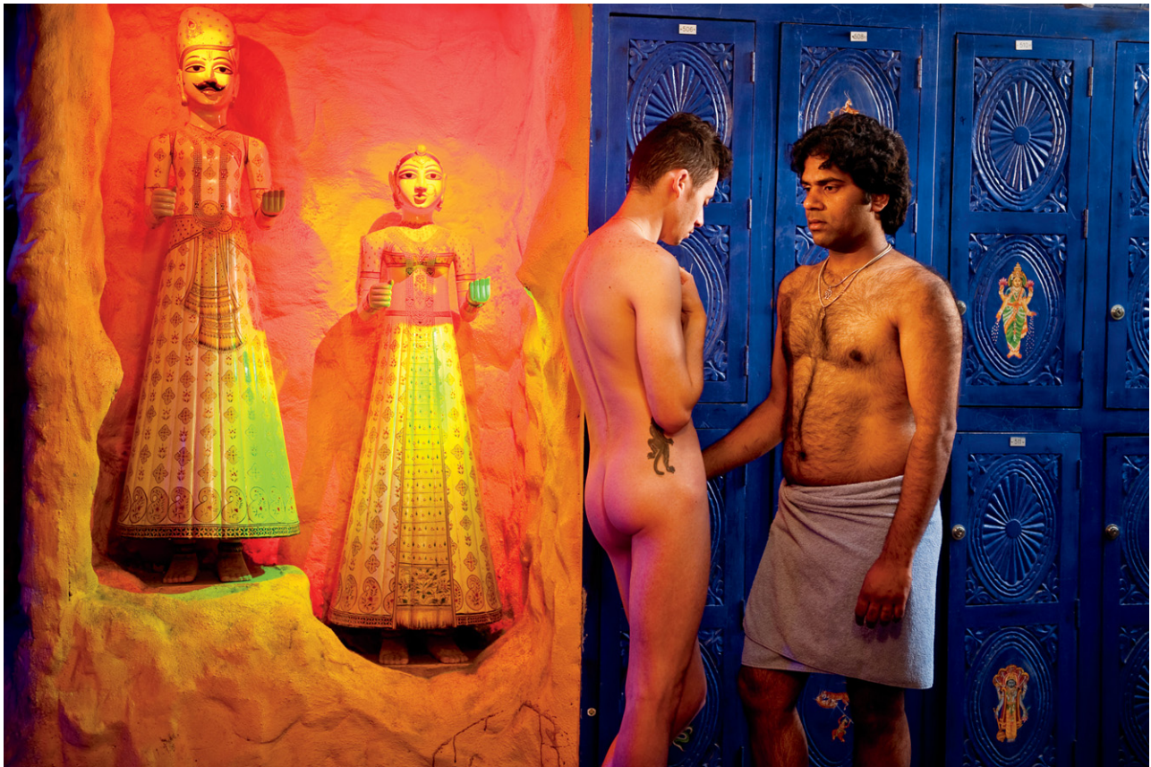
Sunil Gupta, Untitled #3 , from Sun City , 2010 , color inkjet print, 39 \frac{3}{4} x 29 \frac{1}{2} in. (100 x 75 cm)

22. In a series of essays, Kobena Mercer builds this argument but then changes his mind and reads Mapplethorpe's series as a manifestation of desire for the black body; Mercer, Welcome to the Jungle: New Positions in Black Cultural Studies (New York: Routledge, 1994). However, alongside several scholars working on art history and blackness, I maintain that Robert Mapplethorpe's Black Book series fetishizes the black gay male body.